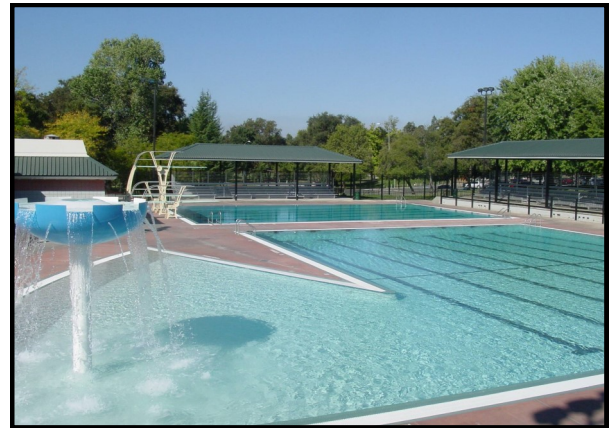
Features: 0-depth entry, diving boards, spray feature